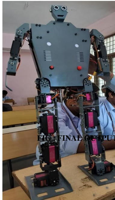
FIG 1.2 FINAL OUTPUT