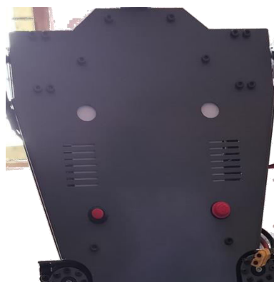
FIG 1.1 BODY