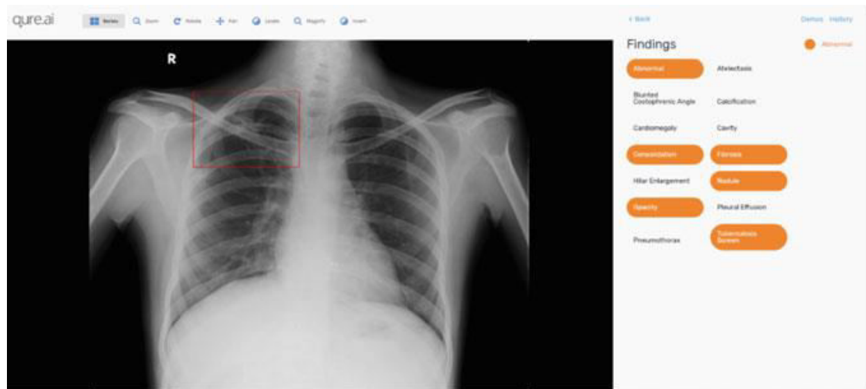
Fig. 3 qXR software output image with abnormalities

of 16 years [22]. It was necessary to have a DICOM image format, as well as the capacity to process photographs of people who were at least four years old, as well as the ability to process images from a CR or DX source in CAD4TB software (scanned films are not acceptable).