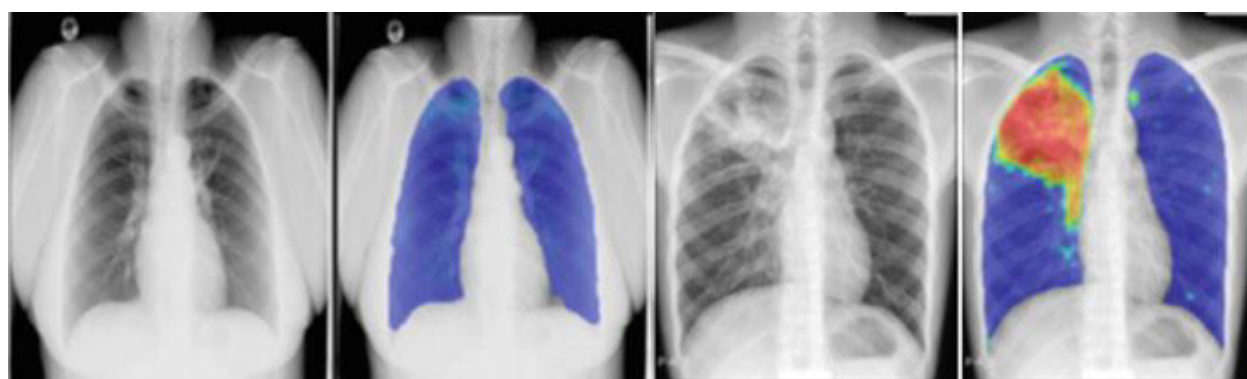
(a) (b) (c) (d)

Fig. 1 Two example CXRs with corresponding output heat maps using CAD4TBv6. a) CXR image with negative TB, an abnormality score of 17. b) Corresponding abnormality heat map. c) CXR image with positive TB, an abnormality score of 82. d) Corresponding abnormality heat map